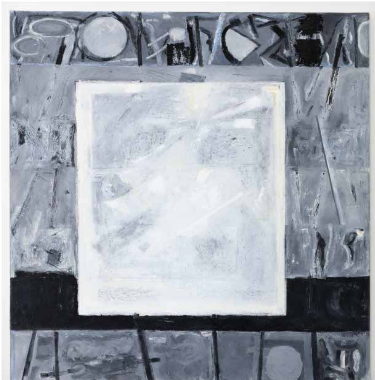
Katherine Porter, In Athens , 2014, oil on canvas, 42 x 38 in