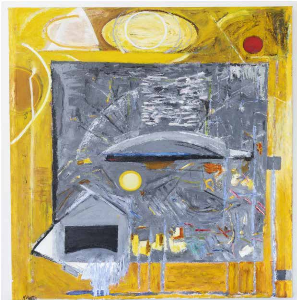
Katherine Porter, Sunset , 2015, oil on canvas, 42 x 38 in