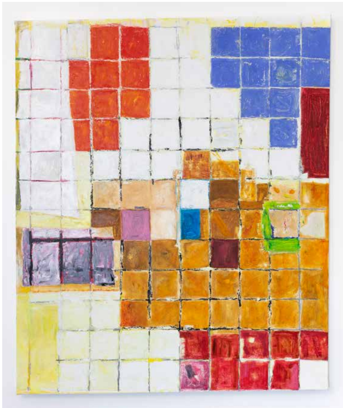
Katherine Porter, House of Cards , 2018, oil on canvas, 50 x 42 in