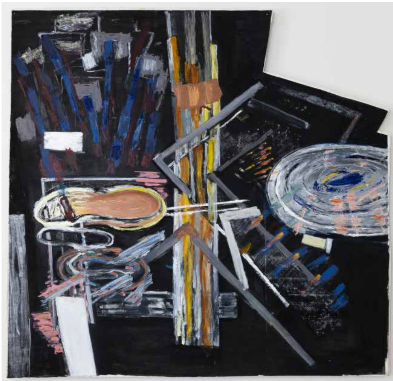
Katherine Porter, Untitled , 1996, oil on canvas, 47-3/4 x 45-1/2