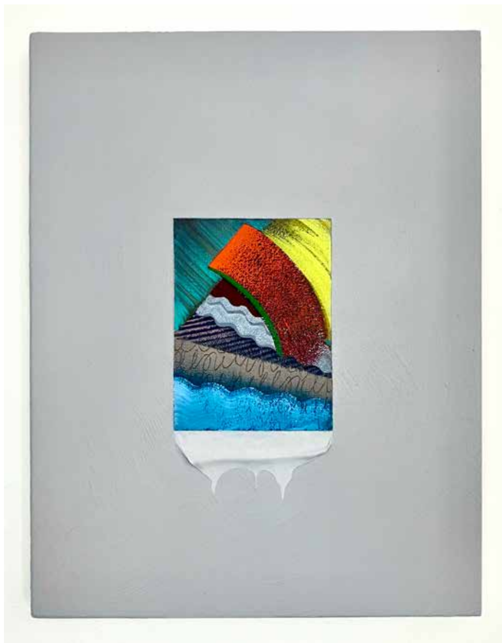
Alex Olson, Baby , 2023 oil, modeling paste on canvas 11 x 8-1/2 in