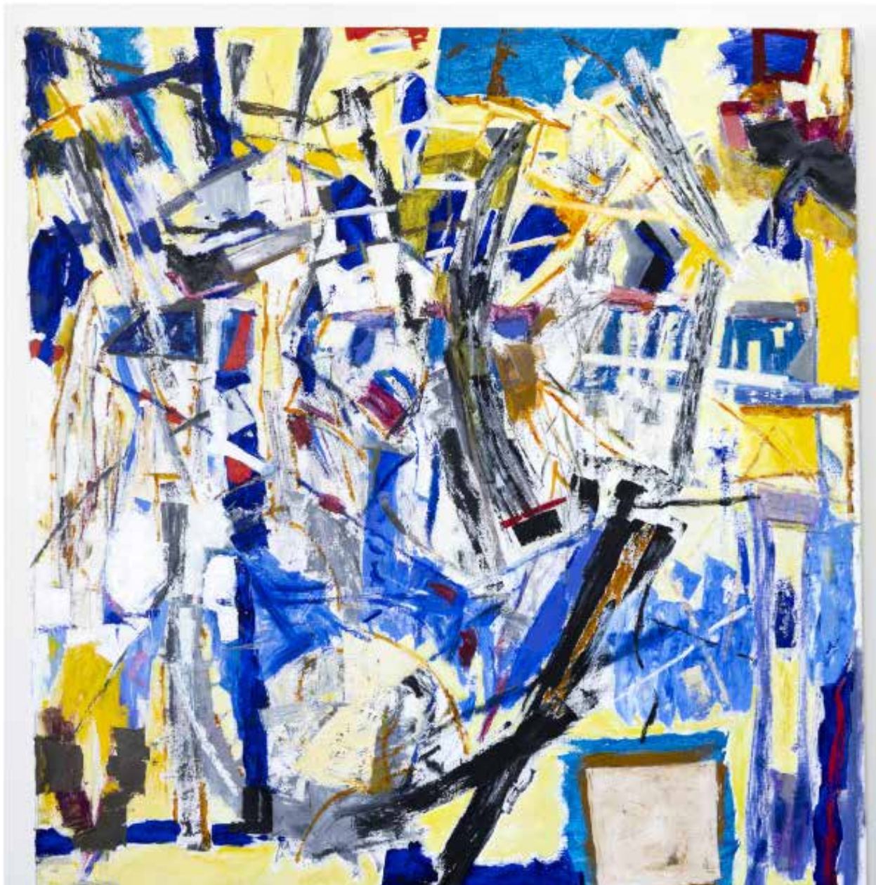
Katherine Porter, Night Music , 2019, oil on canvas, 48 x 42 in