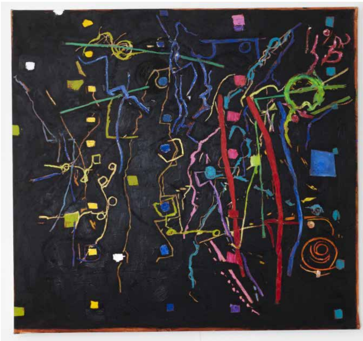
Katherine Porter, Black Diamonds , 2015, oil on canvas, 42 x 42 in